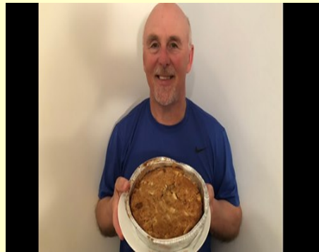
Virtual Food Programs