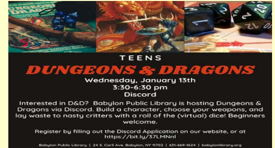
Virtual Teen Programs