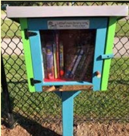
Little Free Libraries