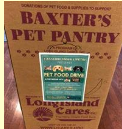
Pet Food Drive