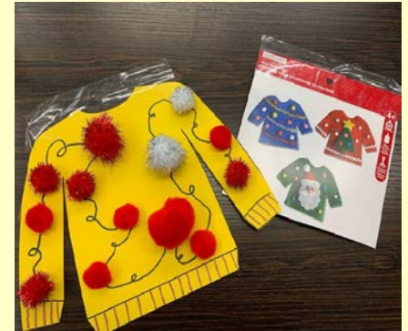
Grab & Go Crafts