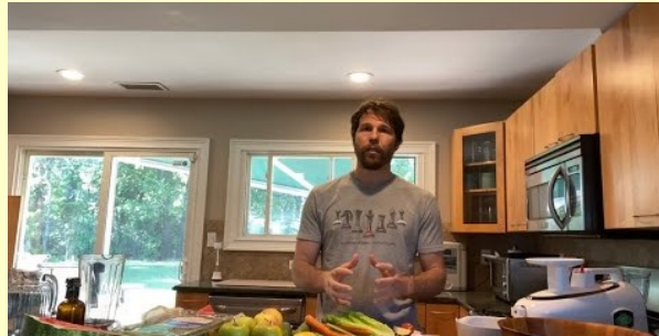
Virtual Cooking Classes