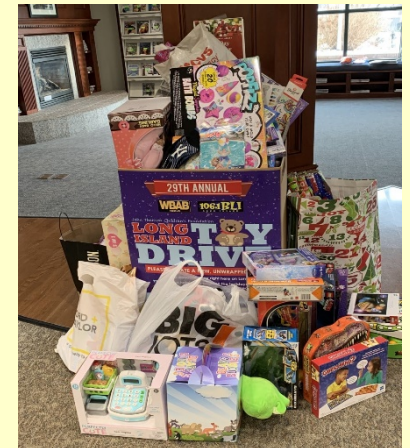
Annual Toy Drive