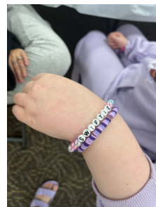
Taylor Swift Party